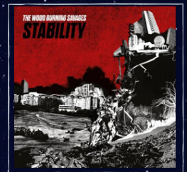
The Wood Burning Savages - Stability (Self Release)