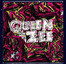
Queen Zee - Loner (Self Release)