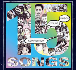
Go Wolf - Voices (Kitsune)