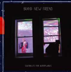
Brand New Friend - Seatbelts For Aeroplanes (Xtra Mile)