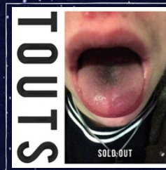
TOUTS - Sickening & Deplorable (Hometown Records)